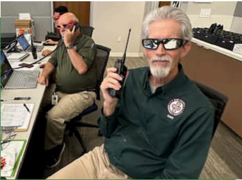
CERT volunteers in the EOC during the April 8 eclipse; they were handling non-emergency calls (more pics Pg 7)