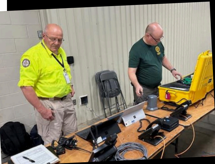
CERT members around the county during the April 8 eclipse

While the eclipse (thankfully) didn't bring chaos or any serious issues, it was an excellent training opportunity for CERT!