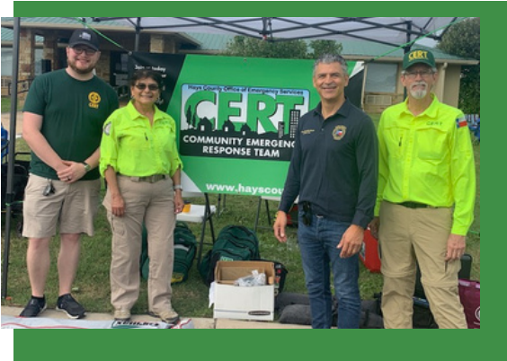
CERT members with the Hays County Judge at the health fair