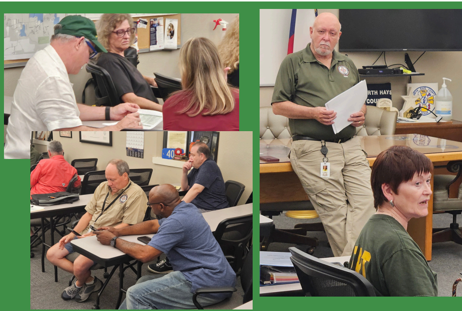
Various CERT members who attended the meeting earlier this month.