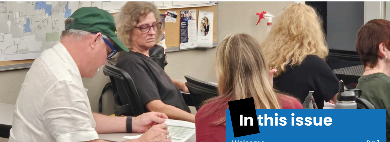
CERT members at the May meeting in Dripping Springs